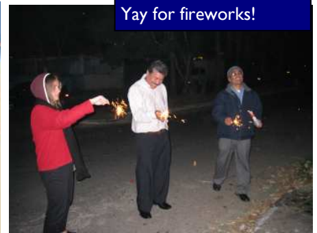
Yay for fireworks!

I spent Christmas with my Guatemalan family this year. At the stroke of midnight on December 24th fireworks begin to explode all over the city and the Christmas celebration begins. The celebration carries on into the early hours of the morning with tamales, songs and gifts.