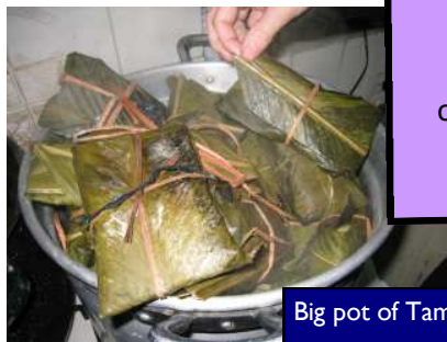
Big pot of Tamales

I spent Christmas with my Guatemalan family this year. At the stroke of midnight on December 24th fireworks begin to explode all over the city and the Christmas celebration begins. The celebration carries on into the early hours of the morning with tamales, songs and gifts.